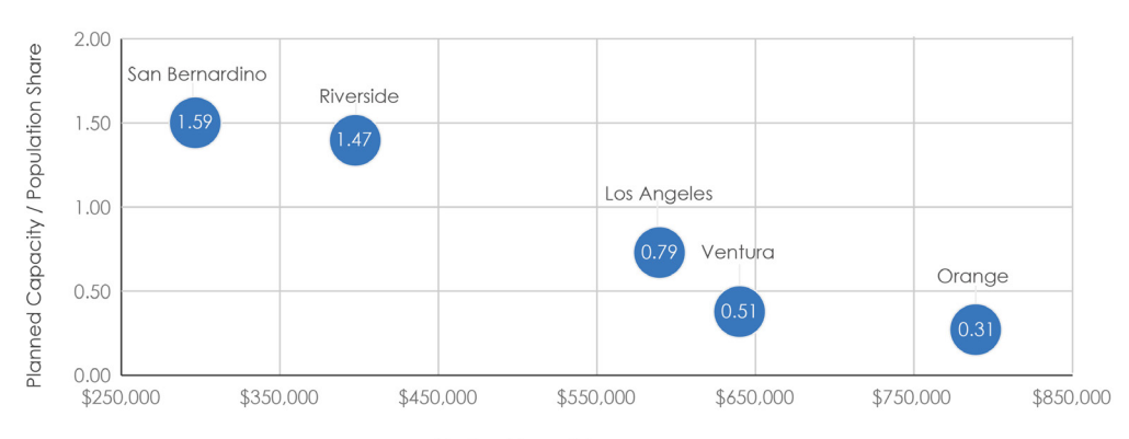
Figure 2. Less planned capacity in highly populated and expensive counties.

housing capacity in the SCAG region, regardless of their density or distance to centers of employment. In a particularly stark example from the previous RHNA cycle, Beverly Hills was one of only 13 cities to be in full compliance with their housing element; however, this is because they were only required to permit three new low-/moderate-income housing units. The city went above and beyond by pretmitting nine.<sup>7</sup>